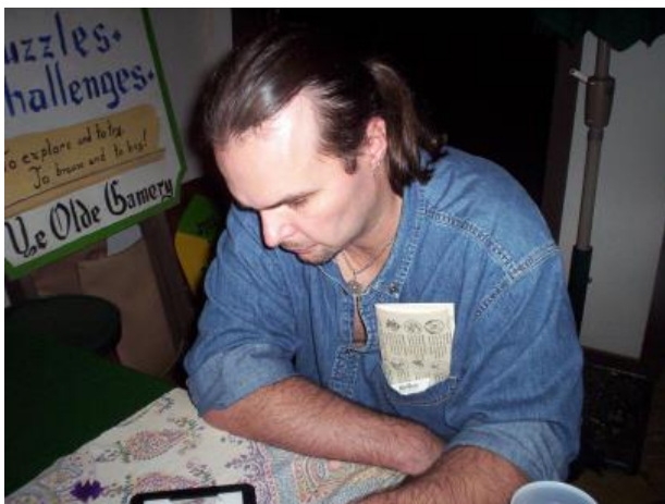
After hours, pondering a puzzle solution. Note the long hair...