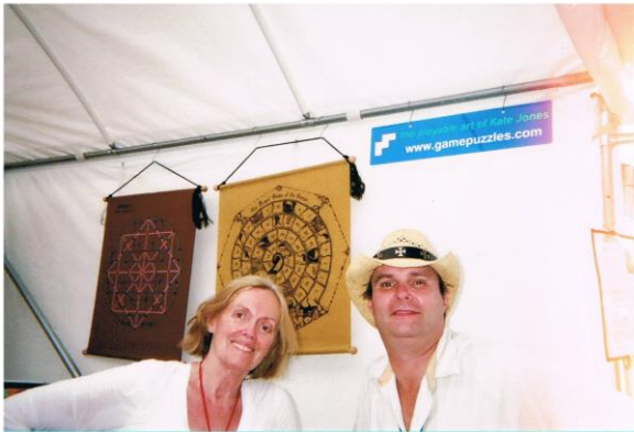
Art show with tent in Jupiter, FL.