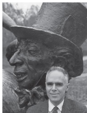
Martin and the Mad Hatter

Our theme for Celebration of Mind this year is "When Are You?" We revisit historical epochs, thinkers and creators, some of whose puzzles and ideas Martin wrote about. See our humorous short time-travel fiction of those visits here: www.gamepuzzles.com/when.pdf .